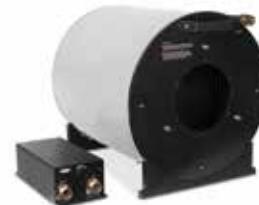
120K-W / 150K-W